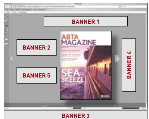
Banners shown are only an indication of dimensions.

sizes in pixels. All files must be supplied as a jpg or SWF (Flash Files) Max file size 250kb for all banner artwork. Only 1 of the two horizontal banner positions may be used on any one magazine